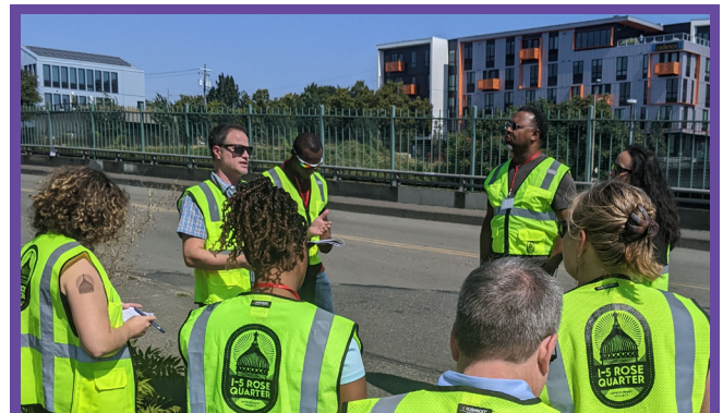
Group takes a walking tour of the project area