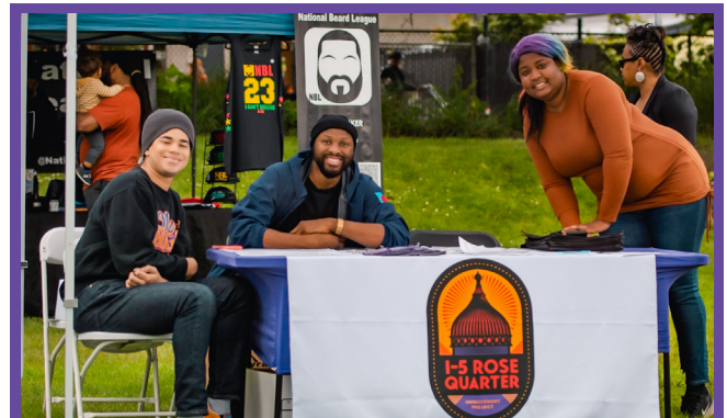
Project staff attends the Juneteenth Oregon 50th Anniversary celebration

The project team is currently working on a Supplemental Environmental Assessment due to design changes from the Proposed Hybrid 3 Cover Concept. A 30-day public comment period will take place in fall 2022 and will include an online open house. A decision on the project is expected from the Federal Highway Administration in early 2023.